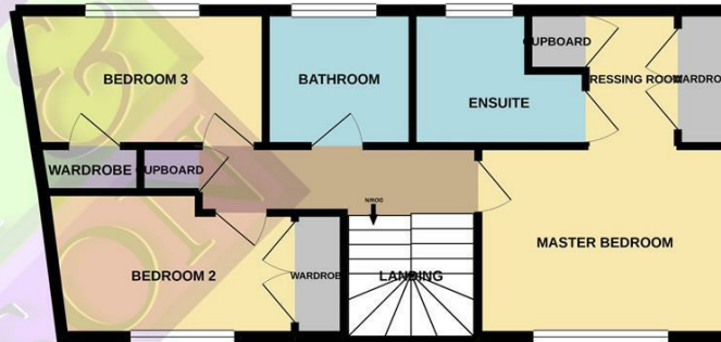
1ST FLOOR 543 sq.ft. (50.4 sq.m.) approx.