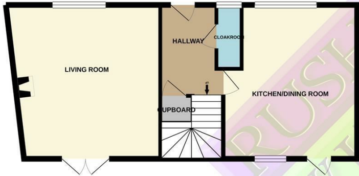
GROUND FLOOR 568 sq.ft. (52.8 sq.m.) approx.